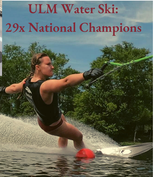
ULM Water Ski: 29x National Champions