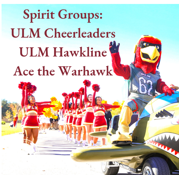
Spirit Groups: ULM Cheerleaders ULM Hawklines Ace the Warhawk